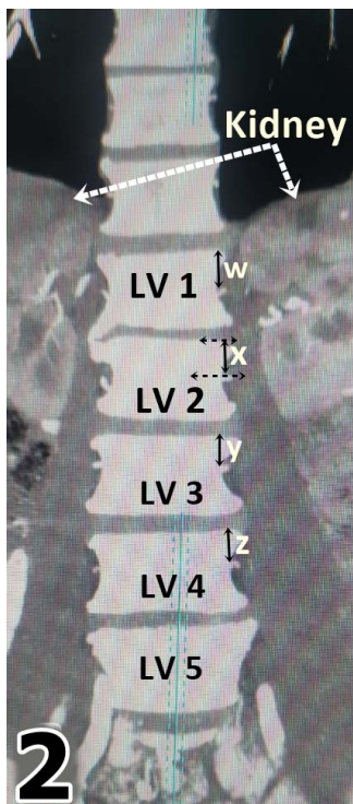
Figure 2. CT showing the measurement of the distances (W, X, Y, Z) between the origin of the lumbar arteries and the top of their respective vertebra. LV, lumbar vertebra.

reduce individual bias. In addition to written records, all specimens were photographed using a Nikon DSLR camera. The relative positions of the vessels and the distance between consecutive lumbar arteries were also plotted out.