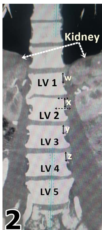
Figure 2. CT showing the measurement of the distances (W, X, Y, Z) between the origin of the lumbar arteries and the top of their respective vertebra. LV, lumbar vertebra.

reduce individual bias. In addition to written records, all specimens were photographed using a Nikon DSLR camera. The relative positions of the vessels and the distance between consecutive lumbar arteries were also plotted out.