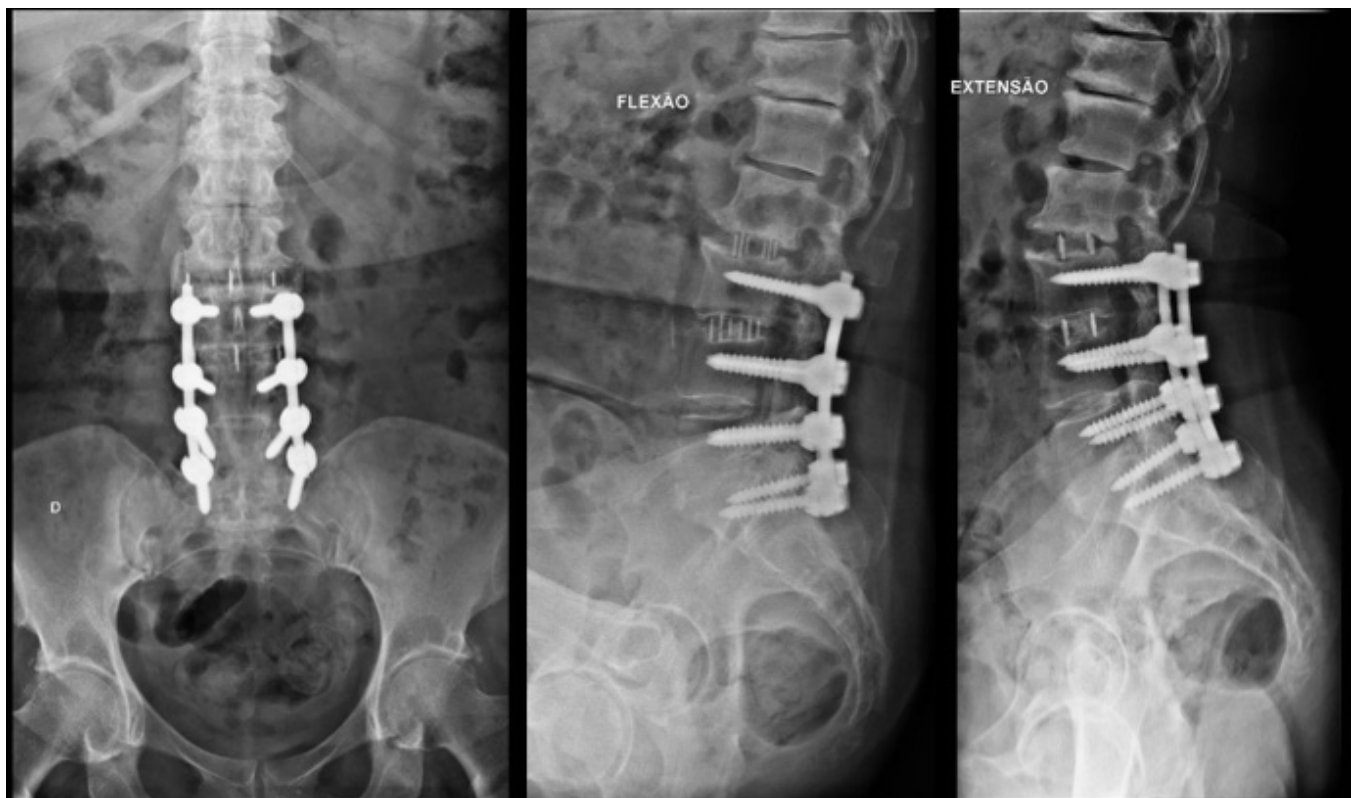
Figure 3. Long term follow-up demonstrating solid fusion in both levels treated with extreme lateral interbody fusion (XLIF).

reason for that variation may be the heterogeneity of the study populations, which might have different preoperative diagnoses. Their study showed that patients with a preoperative diagnosis of foraminal stenosis were more likely to require revision surgery due to loss of indirect decompression with subsidence. 14