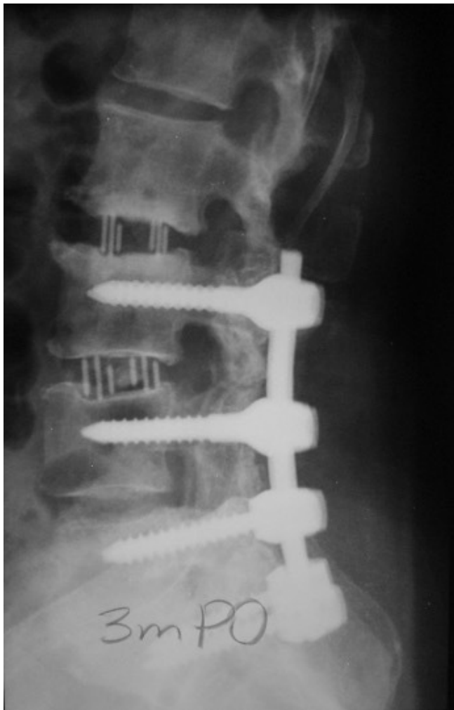
Figure 2. Extreme lateral interbody fusion (XLIF) L3-L4 to correct pseudoarthrosis and stand-alone XLIF at L2-L3 to address adjacent segment disease.

Based on biomechanical tests, they suggested that the stability provided by the extreme lateral interbody fusion spacers with adequate cage height sizing and good bone quality may allow for less supplemental