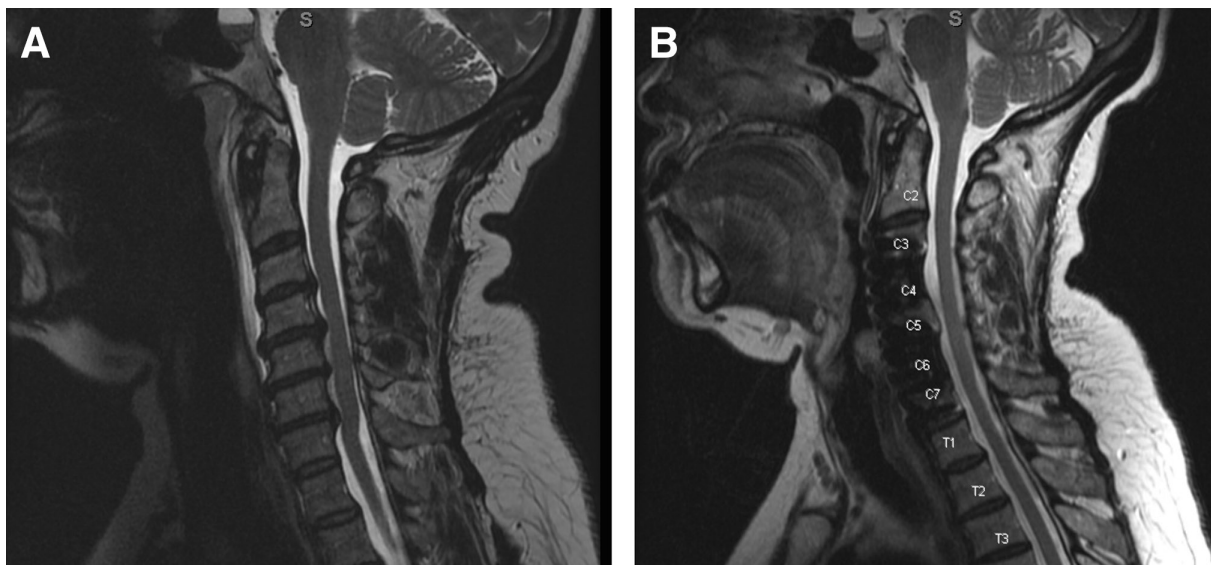
Figure 3. Extent of spinal cord decompression achieved with skip corpectomy (A), (B).

the intervening vertebral body away from the plate, preventing the screw from “pulling” the intervening body to the plate as described by Dalbayrak et al. 21 Surgeons should be aware of these alignment challenges and take measures to overcome them, including aggressive bony and ligamentous decompression to allow for spinal mobility, ventral cage positioning, and bicortical screw purchase (especially in the intervening vertebral body).