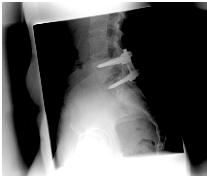
Postoperative lateral (Case 1).