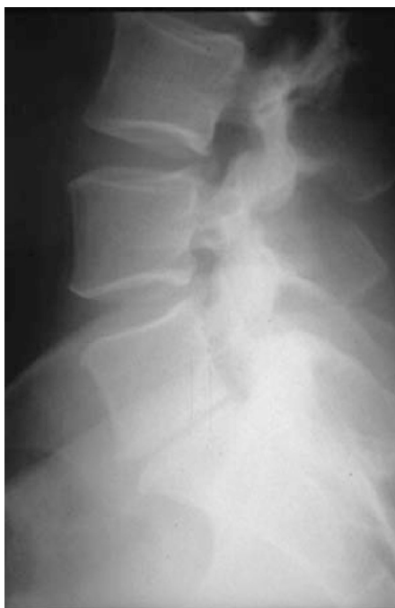
Preoperative lateral (Case 2).

concordant and severely painful L4-5 and L5-S1 injections at low pressure, with a painless injection of contrast at the L3-4 disc space. She was referred to our practice for surgical evaluation. A functional anaesthetic discography study was recommended and performed to obtain further diagnostic information.