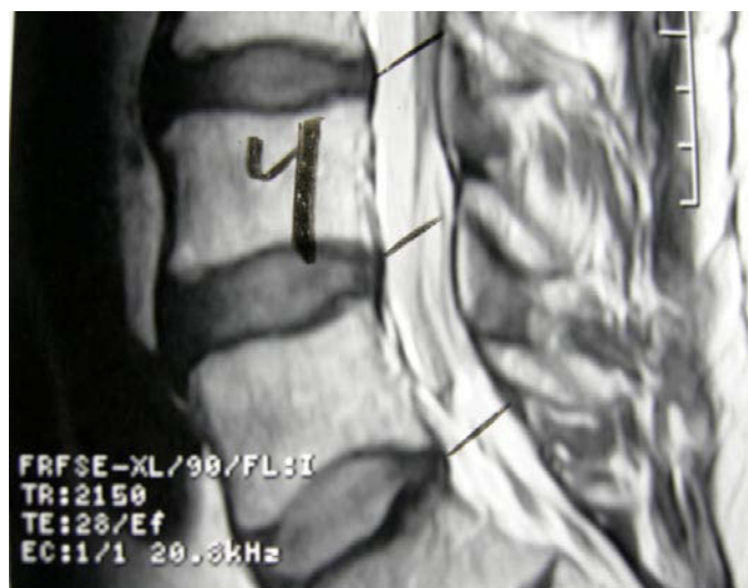
Preoperative MRI (Case 3).

the L4-5 disc space. After provocative positioning in the post-anaesthesia care unit, a double-blinded series of injections was performed, and no relief was noted with anaesthetic in the L4-5 disc space. Fusion surgery was not recommended. After 1 more year of conservative management, his clinical condition is unchanged, with an Oswestry of 46% and a VAS score for pain of 6.