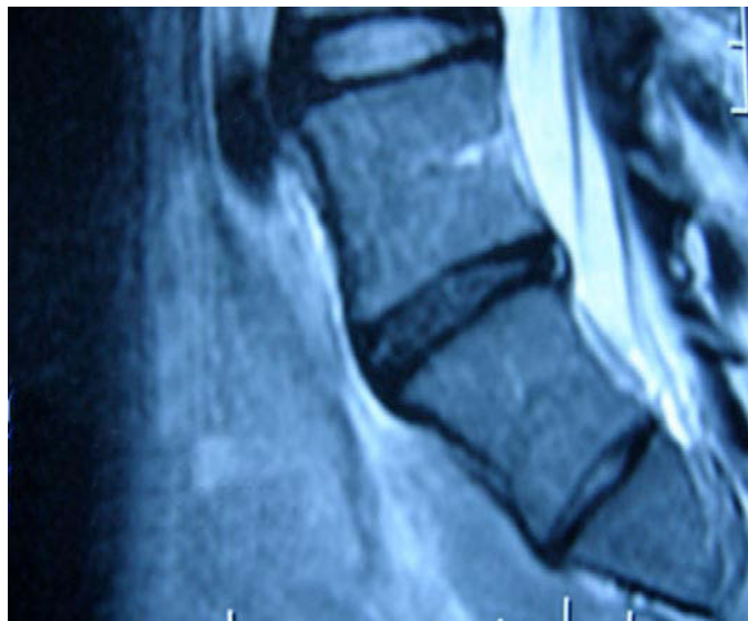
Preoperative MRI (Case 1).

Her chief complaint on evaluation was that of low back pain with intermittent radiation to her right buttock which was exacerbated by sitting as well as any vigorous activity. Her neurologic exam was within normal limits. She was at this point 10 months out from the nucleoplasty and fibrinogen injection, and back on narcotic medications (fentanyl patch 75 mcg, Percocet) as well as an anti-inflammatory (rofecoxib [Vioxx]). Her Oswestry score was 54%, and her VAS for back pain was 7. Her score on the Zung Self-Rating Depression Scale was 28, and her modified somatic perceptions questionnaire (MSPQ) was 13. Because of the possibility that the previously positive provocative discogram could have been a false-positive test, a functional anaesthetic discogram was recommended and performed to obtain further diagnostic information.