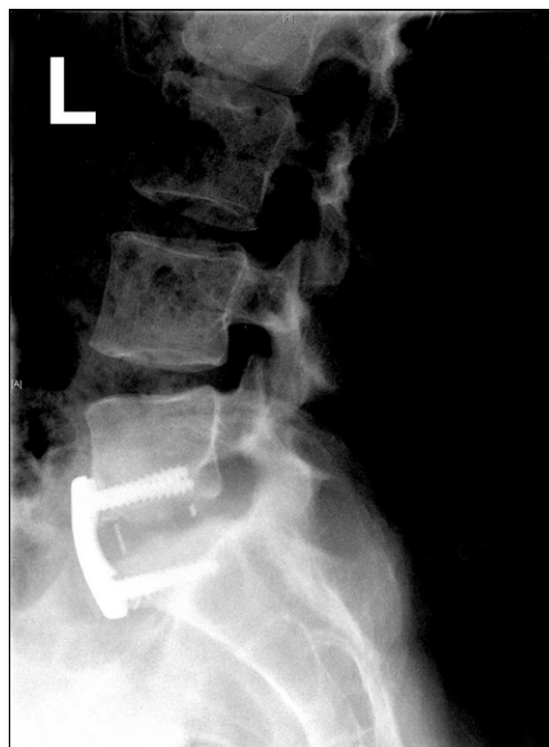
Postoperative lateral (Case 2).

returned to work and has had persistent chronic lower back pain since. Over the course of his treatment, he underwent multiple courses of physical therapy, epidural injections, and has chronically been on narcotic analgesics (Vicodin). He worked since the time of his injury as a carpenter until about 1 year prior to evaluation, but has had intermittent exacerbations of his back pain, which have in the past caused him to miss work for several weeks at a time. One year prior to evaluation, he again sustained an exacerbation of his back pain while at work and had been unable to return to work since.