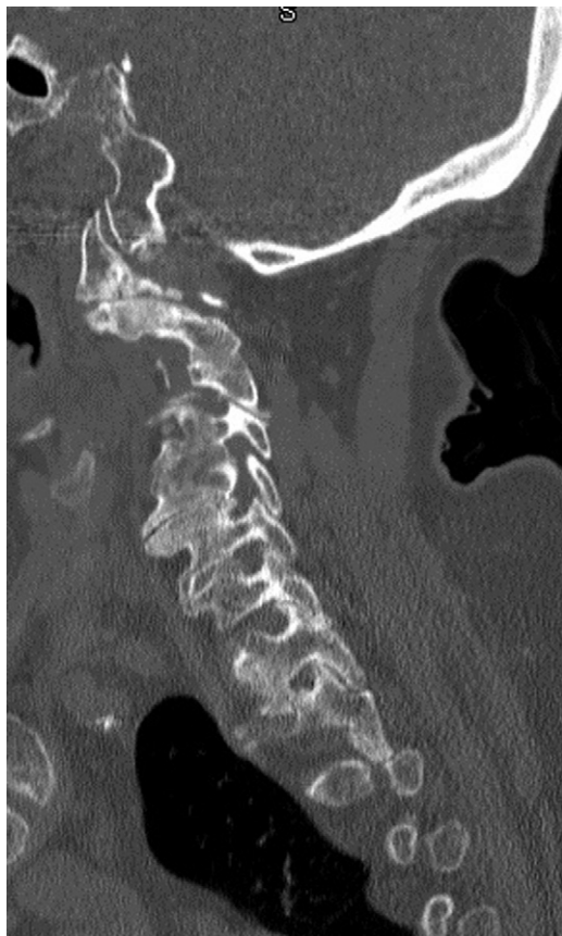
Fig. 6. Example of lateral mass erosion preventing access to C1 lateral mass.

used in these scenarios, especially in cases of irreducible deformity. 8 This strategy necessitates anterior dissection, however, and does not facilitate reduction. Accordingly, and corresponding to the diversity of subluxation-associated deformity, a variety of posteriorly based reduction techniques have been described. Goel and Laheri 7 have treated cranial settling associated with C1–2 instability by release of the C1–2 joints and atlantoaxial or occipito-atlantoaxial instrumentation with plates and screws. Several authors have described treatment of basilar invagination due to atlantoaxial instability with posterior instrumented reduction using an occipital plate. 8,10 Other instrumented reduction techniques rely on C1 lateral mass screws. 9 The re-