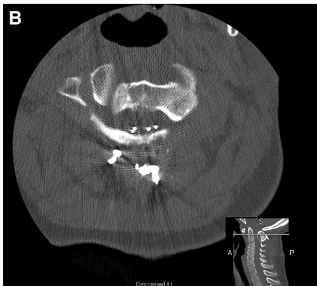
Fig. 1. Sagittal (A) and axial (B) computed tomography images of cervical spine obtained at time of presentation to clinic.