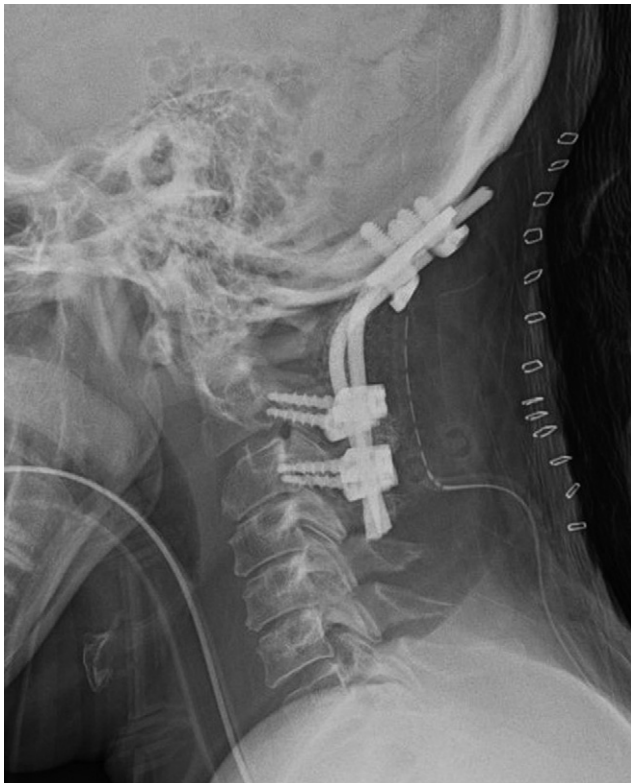
Fig. 4. Immediate postoperative X-ray shows satisfactory reduction.

A postoperative computed tomography scan showed satisfactory decompression and reduction (Fig. 5).