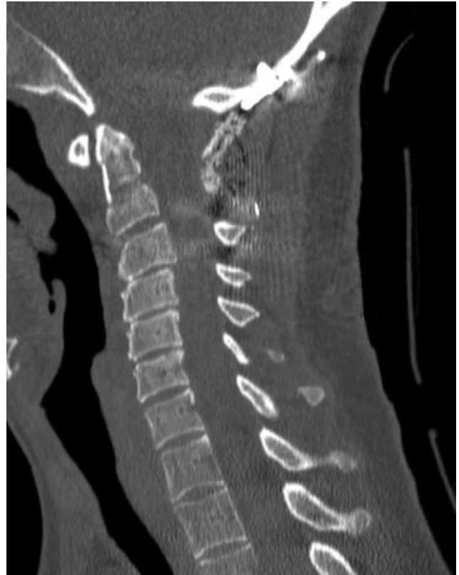
Fig. 5. Postoperative axial computed tomography image showing maintenance of reduction.

The patient's recovery was unremarkable, and she was discharged home on postoperative day 4. In the early postoperative period, a right iliac vein deep venous thrombosis developed where a femoral line had been placed. (The patient's halo had made preoperative placement of an internal jugular or subclavian line impractical.) Nine months of warfarin therapy was begun with an international normalized ratio goal of 2.5 to 3. X-rays taken 3 months after surgery showed maintenance of the patient's cervical reduction.