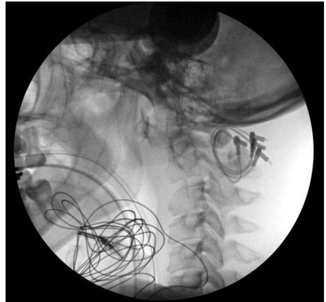
Fig. 2. Fluoroscopic intraoperative image showing failed closed reduction.

The patient’s neck was then prepared and draped, and a midline subperiosteal approach was performed with sharp dissection and bipolar electrocautery to avoid monopolar contact with the C1–2 cables. With the cervical spine exposed from the occiput to C3, laminectomy of C1 and C2