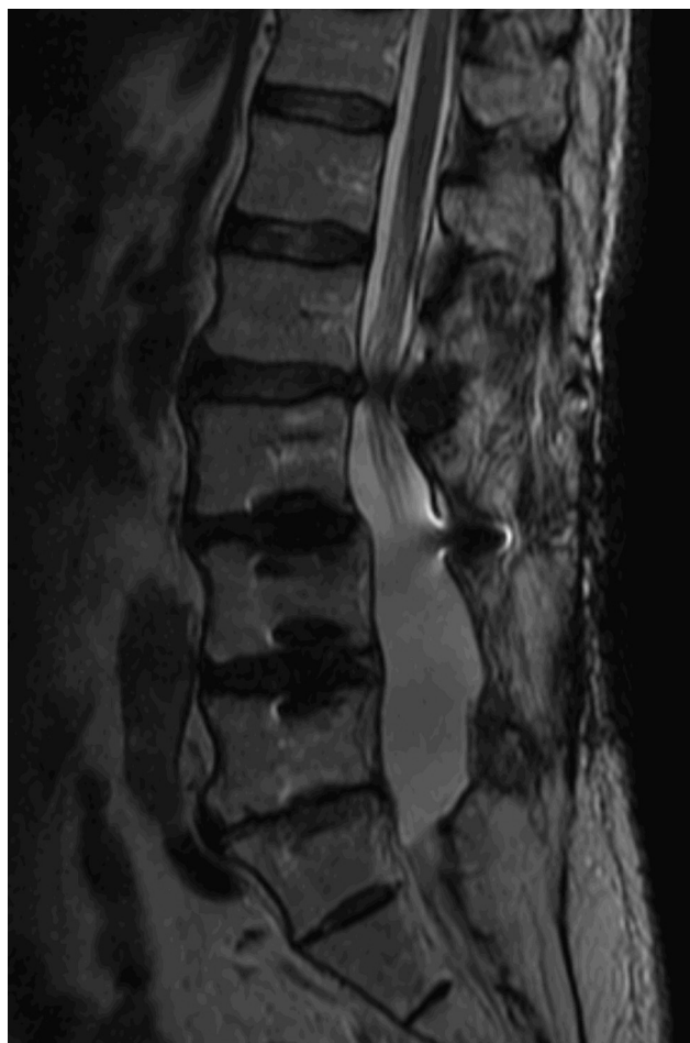
Fig. 1. Sagittal T2-weighted image of the lumbar spine.

endplates were prepared, a trial spacer was inserted into the disk space causing distraction across the disk space. At this time, s-EMG activity ceased. The trial was then removed, and the s-EMG activity returned. The interbody cage was then inserted into the disk space—again causing distraction