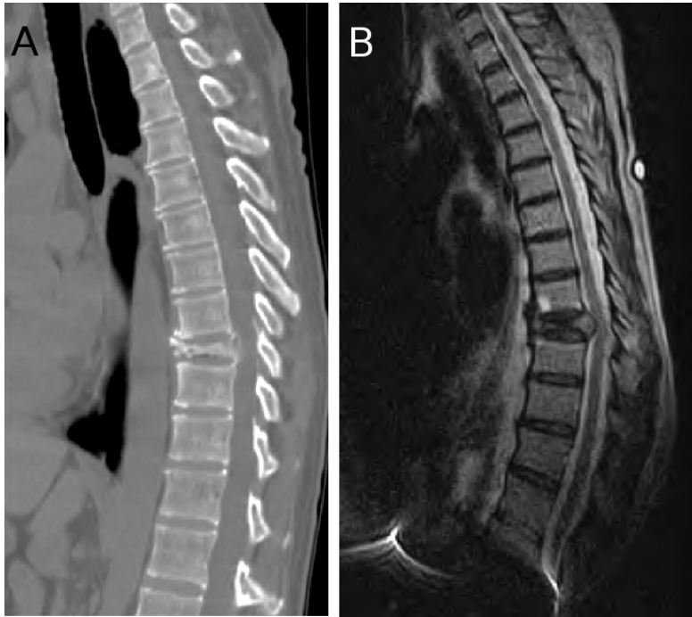
Fig. 1A & 1B. CT and MRI showing the T9 osteolytic collapse secondary to lung cancer in a 56 year old female (Case 1).