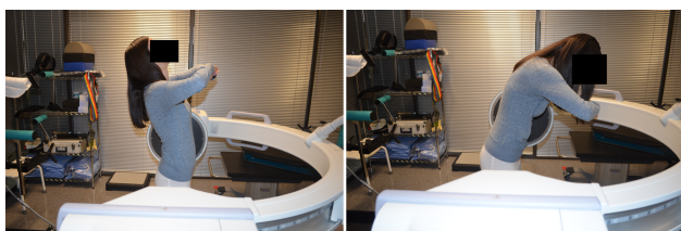
Fig. 3. Flexion extension radiographs (FE) at a self-selected pace and position.

The symptomatic patient set was collected via a consecutive case enrollment design, wherein all patients