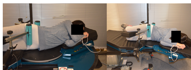
Fig. 2. VMA recumbent flexion/extension position.