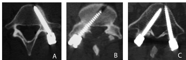
Fig. 1. Postoperative axial CT image depicting the classification used for accuracy assessment. A. No breach. B. Minor breach \leq 2 mm. C. Major breach \geq 3 mm.

All of the cases were performed under general anes-