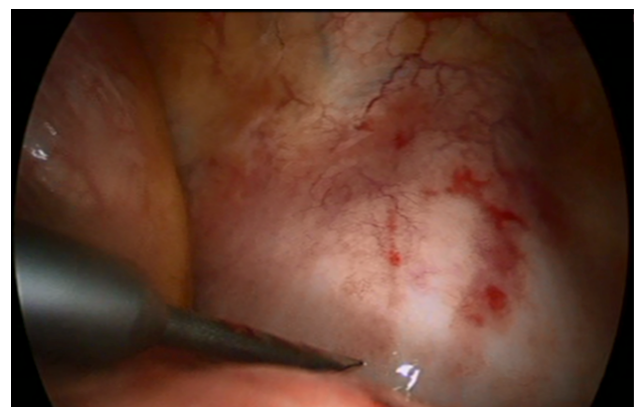
Fig. 3. Intra-operative view of the bulging parietal pleura.

Spondylodiscitis can be classified as pyogenic, granulomatous (tuberculosis, brucellosis, fungal) or parasitic. 1,4 The pathogenesis of pyogenic spondylodiscitis can be haematogenous, by external inoculation or