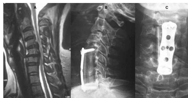
Fig. 2. 58 year old male. (A) T2 sagittal MRI showing cord compression and signal changes between C4-7, (B) and (C) 31 month postoperative antero-posterior and lateral X-ray showing C5 and C6 corpectomy and FVFG reconstruction fixed by anterior locked plate with solid fusion.