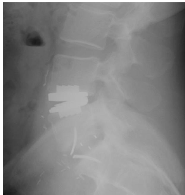
Fig. 1. Bastrup's Syndrome at the level of prior L4-5 disc replacement.

injection was performed and resulted in significant pain relief for a temporary period of time. A partial excision of the L4 and L5 spinous process was performed as a definitive therapy.