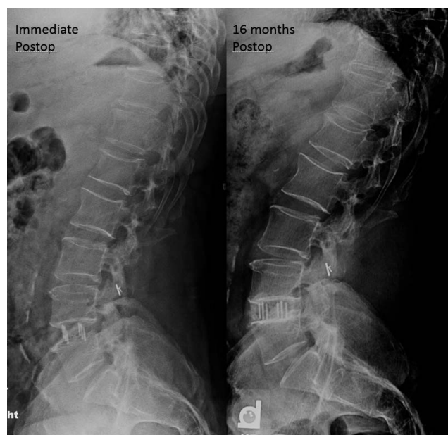
Figure 2. X-rays from a subject in the alendronate group immediately postoperative and at final follow-up, noting no subsidence of cage.

The institutional review board at our medical center approved this study.