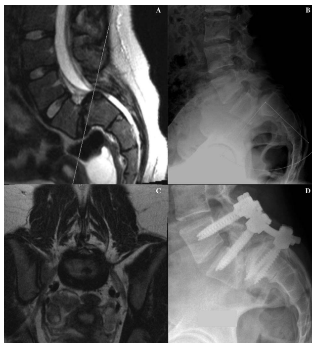
Figure 4. This is a 14-year-old gymnast presented with chronic lower back pain without radicular symptoms. The (a) T2-weighted lumbar magnetic resonance (MR) image and (b) lateral neutral lumbar plain radiograph show exaggerated lordosis and a grade III spondylolisthesis in addition to mild posterior wedging of L5 and mild deformity of the superior S1 end plate. (c) The axial T2-weighted MR image at L5-S1 depicts severe deformity at this level. (d) The patient underwent a laminectomy at L4-S1 with a posterolateral fusion at L4-L5 and transforaminal lumbar interbody fusion (TLIF) at L5-S1 following a reduction attempt at L5-S1.

The partial reduction and fusion is an adaptation of the reduction and fusion procedure with advantages that include increased fusion rates in patients with an unbalanced pelvis and lower risks of complications compared with a full reduction (Figure 4). 73,74 In this technique, the patient is positioned prone and intraoperative monitoring such as somatosensory evoked potentials or electromyography is used throughout the procedure. The L4-S2 segments are exposed, and a complete L5 laminectomy, and wide decompression of the bilateral L5 and S1 nerve roots is performed. Subsequently, a L5-S1 discectomy and partial excision of the sacral dome is completed to shorten the L5-S1 segment. Pedicle screws are then placed at L4, L5, and S1. A gradual reduction with cantilever flexion of the sacral-pelvis unit follows via a combination of patient positioning and gentle downward force on the sacrum. This