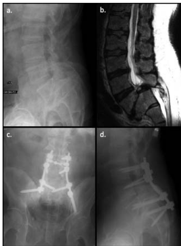
Figure 2. This is a 56-year-old male who presented with right leg weakness and urinary incontinence. (a) Lateral lumbar plain radiograph and (b) T2-weighted magnetic resonance imaging of the lumbar spine demonstrated a Meyerding Grade IV spondylolisthesis at L5-S1. As depicted in the (c) anteroposterior and (d) lateral lumbar plain radiographs, he subsequently underwent a laminectomy at L4-S2, a posterolateral fusion from L3-Pelvis, a sacral dome osteotomy, with an additional L5-S1 discectomy and mixed allograft and local autograft placement. No formal reduction maneuver was attempted intraoperatively.

Indications for surgical management of HGS include persistent symptoms, failure of conservative management, radiographic parameters suggestive of imminent slip progression, significant biomechanical stress, and global sagittal imbalance. This section provides an overview of various surgical techniques used in the treatment of HGS in adults, in particular for progression of isthmic slips, which usually present symptomatically when unbalanced. The most common surgical techniques include (1) in situ fusion techniques using posterolateral, anterior, or circumferential approaches; (2) fusion and