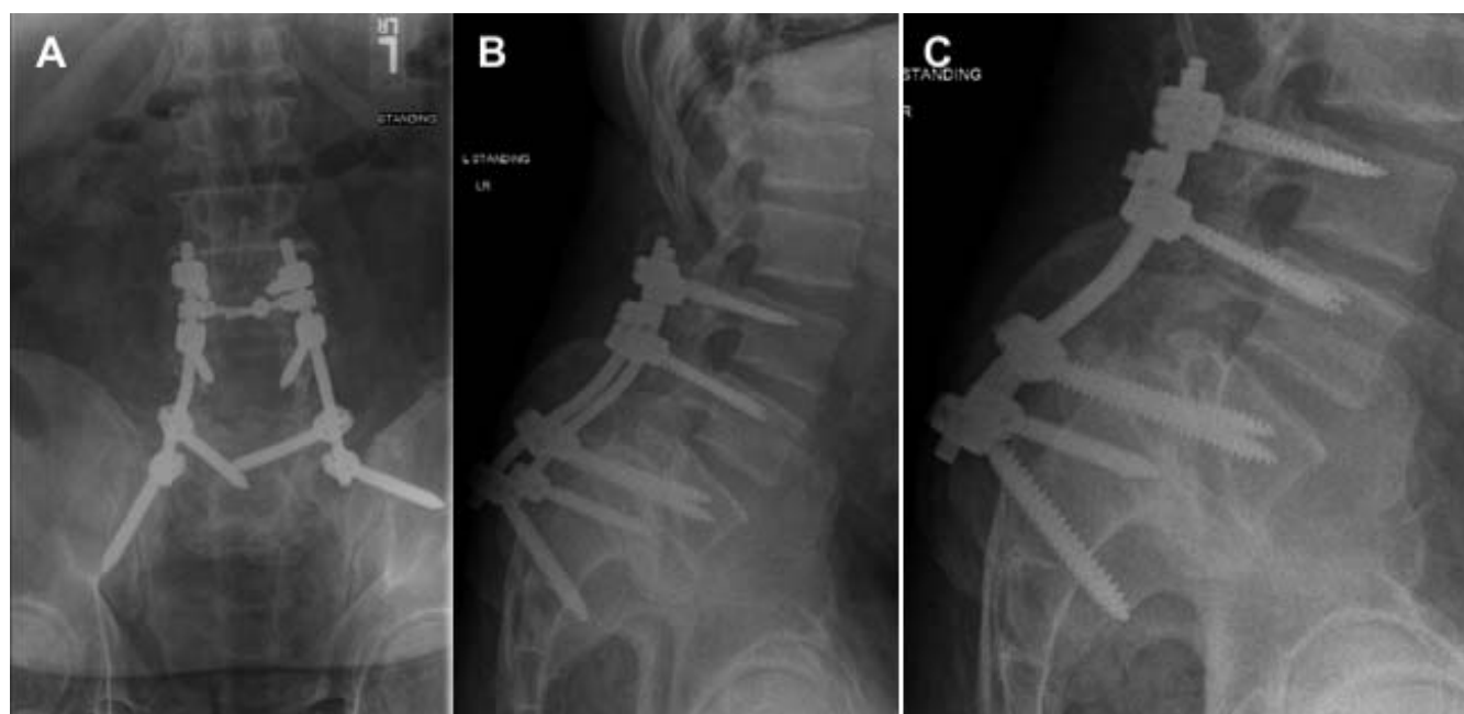
Figure 3. Three views of circumferential interbody fusion using transsacral fixation in a patient with high-grade spondylolisthesis (HGS). (a) Anteroposterior (AP) radiograph of sacral pedicle – vertebral body (transsacral) fixation. (b) Lateral radiograph of the sacral pedicle – vertebral body fixation. (c) Dedicated lumbar radiograph of the transsacral lumbar fusion from L3-S1.

balance the tensile forces that the posterior fusion mass is ultimately exposed to in patients with high-grade slips. Finally, a circumferential fusion is completed by placing posterolateral bone graft from L4 to the sacral alae. This technique also has the advantages of providing a wider surface area for bony fusion, restoring disc height to indirectly decompress neural foramen, and provides anterior pivot to allow a more effective correction of the lumbosacral kyphosis with the use of posterior instrumentation. 7