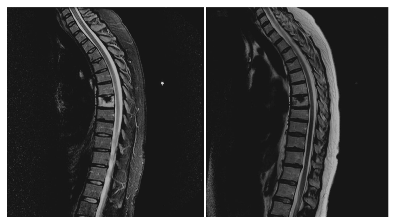
Figure 1. Magnetic resonance imaging (MRI) sagittal T2 STIR—First MRI scan demonstrated high signal intensity on T2 (bone marrow edema) surrounding a large Schmorl node (SN) in T7 vertebral body. A radio-opaque marker on the skin marks the site of the maximum pain. Other smaller SNs are seen in the thoracic spine (left). MRI sagittal T2—First MRI showing the large SN in T7 (right).

described in the literature that present with pain in the spine.<sup>10,12–16</sup> The diagnosis is usually done by magnetic resonance imaging (MRI), which is the most specific and sensitive modality.<sup>15</sup>