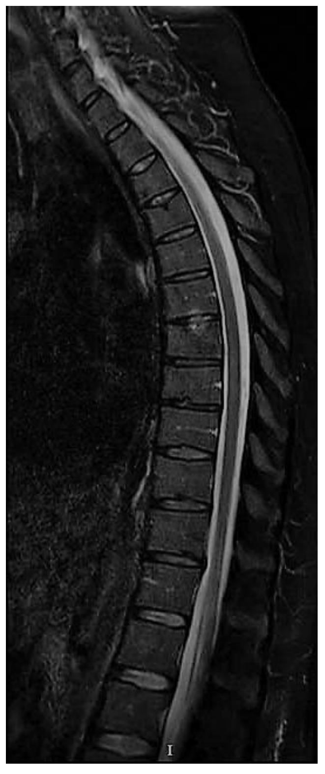
Figure 4. Magnetic resonance imaging (MRI) sagittal T2 at 8-month followup—Complete resolution of the initial Schmorl node (SN) changes.

symptoms. A final MRI scan 8 months after the initial procedure showed an almost complete resolution of the T2 hyperintensity and panvertebral marrow edema, and that there was also