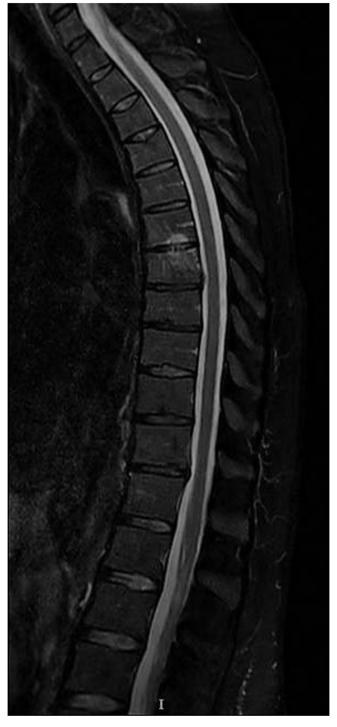
Figure 3. Magnetic resonance imaging (MRI) sagittal T2 at 3-month followup—Partial resolution of the Schmorl node (SN) hyperintensity at T7; some novel inferior end plate edema at T6.

She was reviewed by a spinal surgeon 11 weeks after the initial onset of symptoms, by which time she was largely asymptomatic. A follow-up MRI