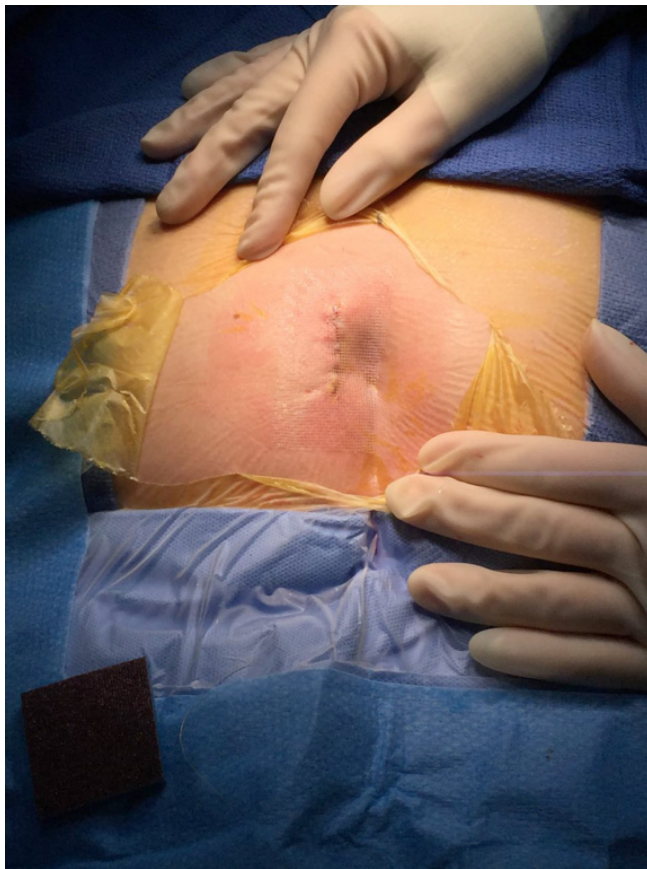
Figure 4. Incision dressing.

P = 0.013 ) compared to Type III coccyx ( 41.86 \pm 12.03 years old).