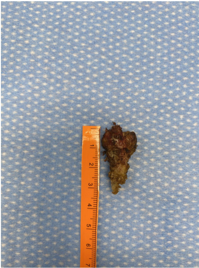
Figure 2. Excised coccyx.