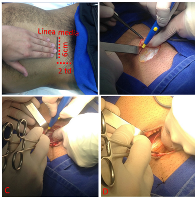
Figure 1. (A) Demarcation for anterior lumbar interbody fusion approach, right L5-S1 level, incision 6-cm long, 3.5 cm above the pubis, and 3.5 cm away from midline. (B) Exposure of the rectus abdominis anterior sheet. (C) The rectus abdominis anterior sheet and fascia transversalis are opened, then the arcuate line of Douglas is incised. (D) Finger dissection of retroperitoneal space with visible retroperitoneal fat.

the incision, and the neurosurgeon performing dissection of retroperitoneal structures stands ipsilateral to the incision.